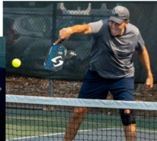
And everyone in between