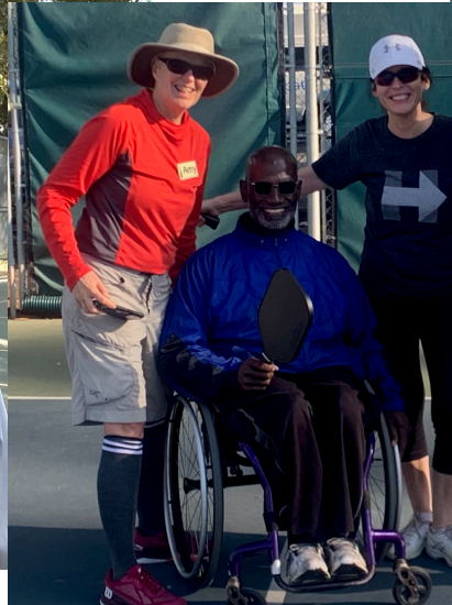
Many regulars with physical limitations, MS, Parkinsons...